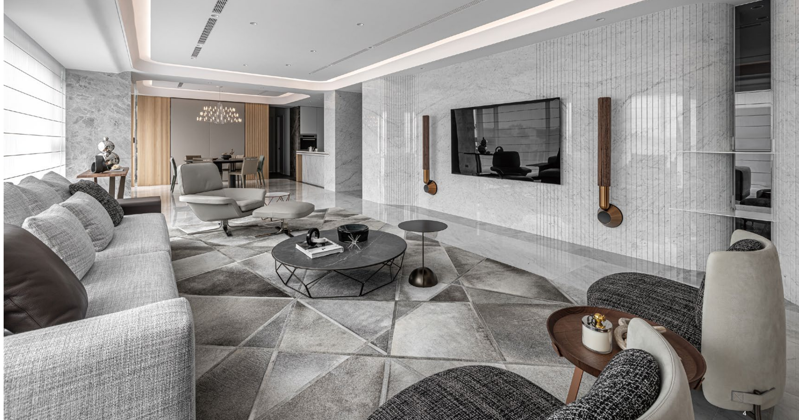
3. 於櫃體下方和地坪處增設燈條，強化空間的框景感受。 4. 室內大面積運用石材，形塑大器內斂之韻味。白色調性則捎來了輕柔氣息。 3. Linear light fixture under the casework emphasizes the framed view. 4. Generous use of stone finishes establishes a quiet lasting appeal while the white tone introduces a soft atmosphere.